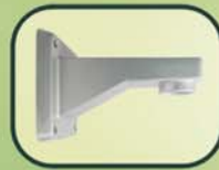
FC-9009ST (304/316 Stainless Steel)